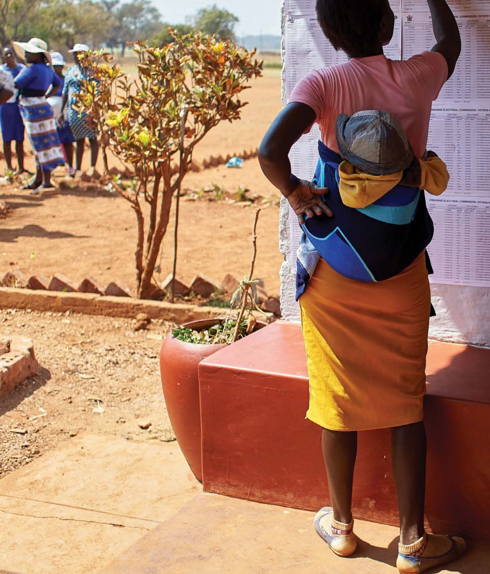
A woman with a baby on her back searches for her name on a voters' list outside a polling station during Zimbabwe's presidential and legislative elections at Sherwood Park Primary School in Kwekwe, August 23, 2023. Zimbabweans on August 23, 2023 began voting in closely-watched presidential and legislative elections.