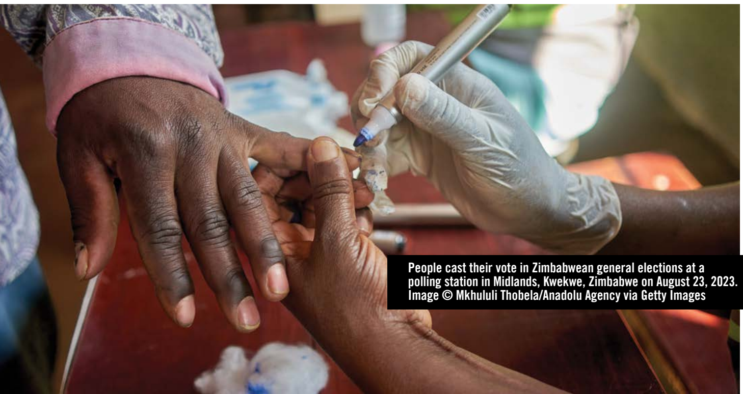
People cast their vote in Zimbabwean general elections at a polling station in Midlands, Kwekwe, Zimbabwe on August 23, 2023.