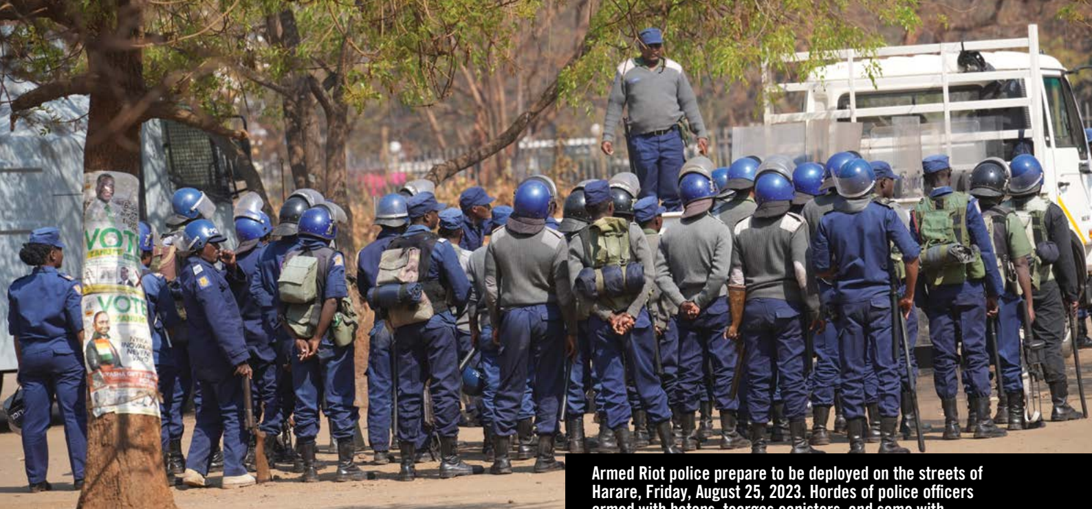
Armed Riot police prepare to be deployed on the streets of Harare, Friday, August 25, 2023. Hordes of police officers armed with batons, teargas canisters, and some with guns were seen next to the result center as Zimbabweans anxiously waited for the outcome of general elections after polls closed on Thursday and authorities tightened security around the results center.