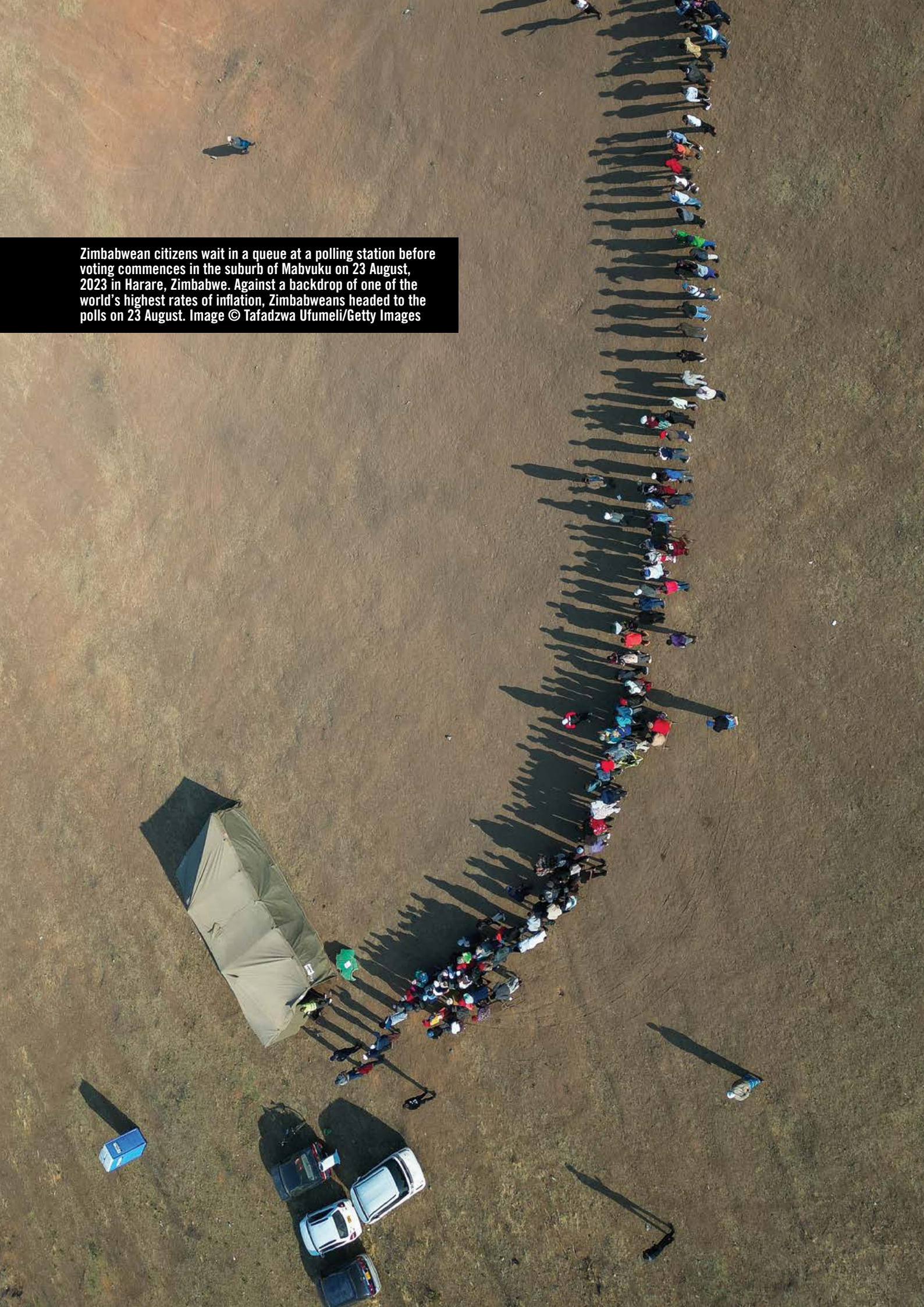
Zimbabwean citizens wait in a queue at a polling station before voting commences in the suburb of Mabvuku on 23 August, 2023 in Harare, Zimbabwe. Against a backdrop of one of the world's highest rates of inflation, Zimbabweans headed to the polls on 23 August.