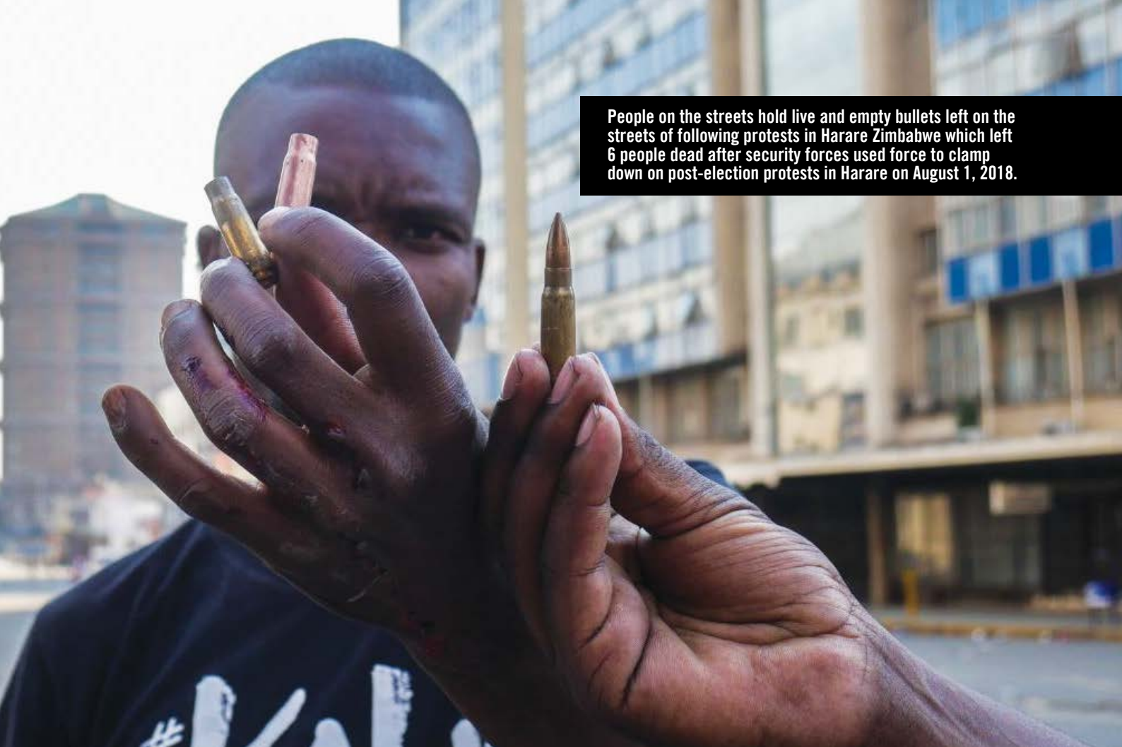
People on the streets hold live and empty bullets left on the streets of following protests in Harare Zimbabwe which left 6 people dead after security forces used force to clamp down on post-election protests in Harare on August 1, 2018.

excessive force as a primary method of law enforcement, a trend that was common during the previous administration. The violent incidents that occurred after the elections and fuel protests are not justifiable under Zimbabwean law nor international